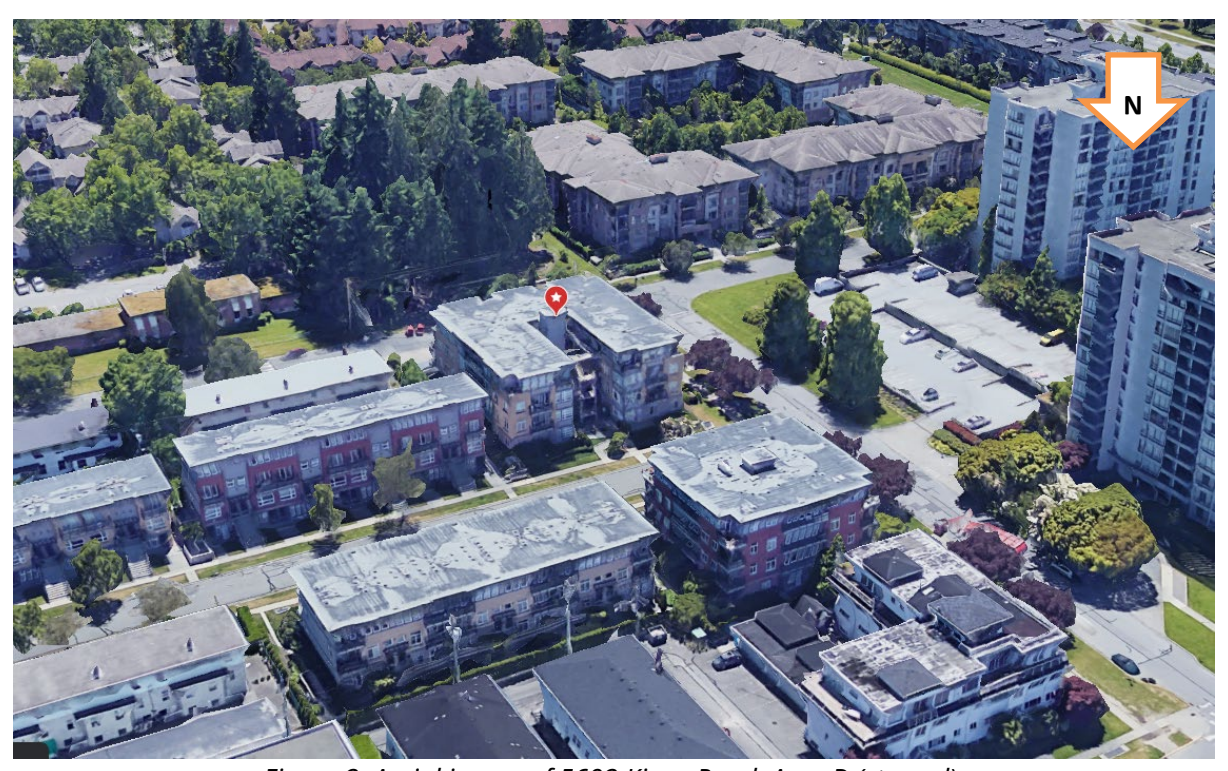
Figure 2: Aerial image of 5692 Kings Road, Area D (starred).